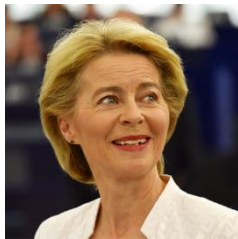
Ursula von der Leyen

The joint European Roadmap towards lifting COVID-19 containment measures, presented by the President of the European Commission and the President of the European Council, responds to the European Council Members' call for an exit strategy that is coordinated with Member States and that will prepare the ground for a comprehensive recovery plan and unprecedented investment.